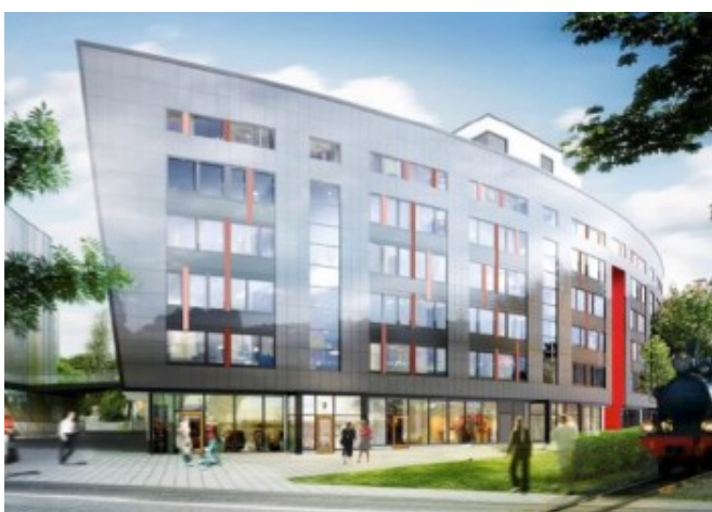
(2) Revised design with thin-film modules © White arkitekter