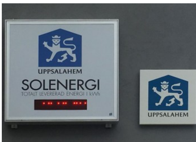
Display on the façade