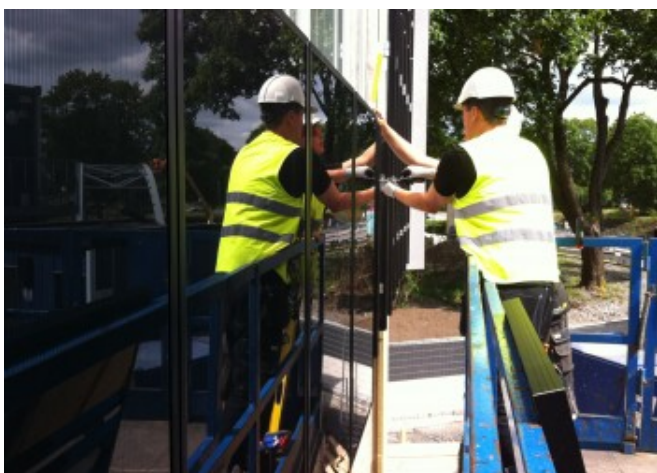
The installation was made with a scissor lift