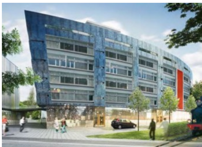
Evolution of the BIPV façade. (1) Original design in building permit