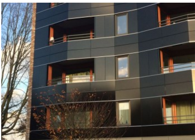
BIPV façade with standard modules