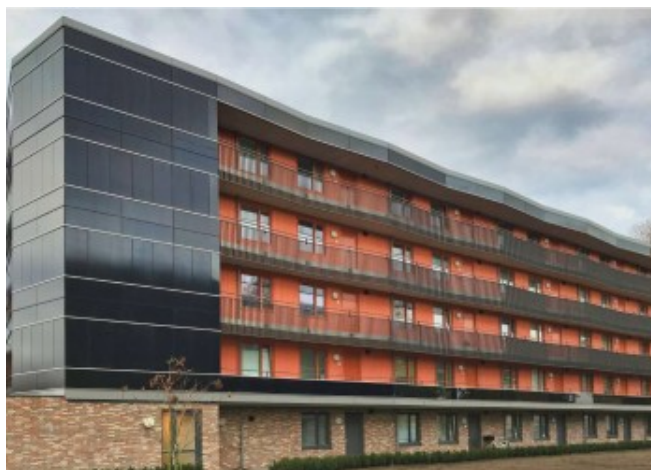
North-East façade with partly BIPV (left side)