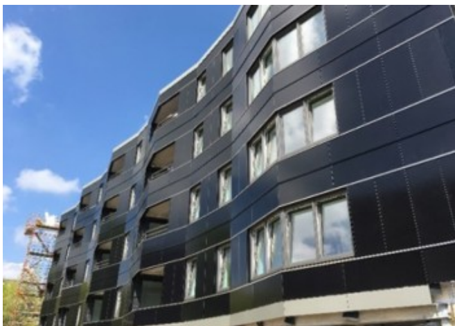
BIPV modules installed in a zigzag shape