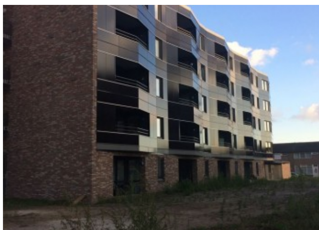
BIPV façade in the late afternoon © BEAR-iD