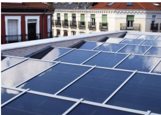
BIPV roof from the outside