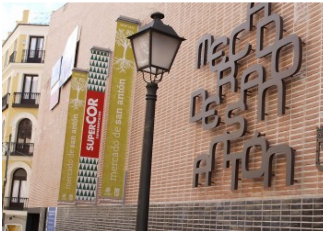
San Anton Market in the centre of Madrid