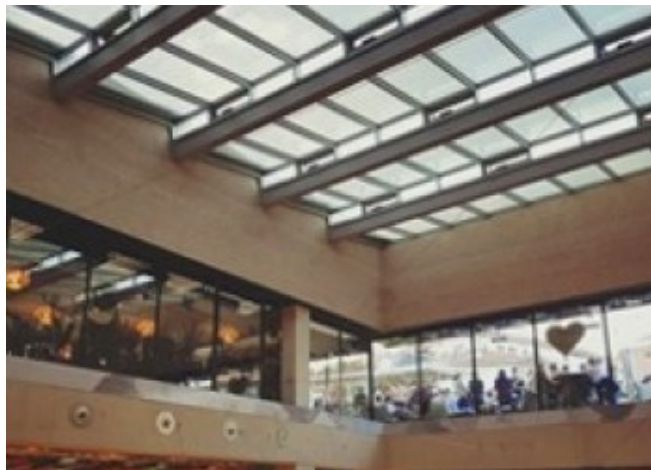
San Anton Market local meeting point, including a market of perishable goods, bars and restaurants