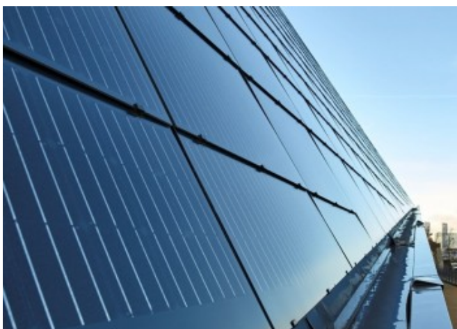
BIPV roof detail © René Schmid Architekten AG