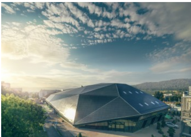
BIPV roof overview © René Schmid Architekten AG