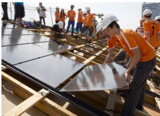
Detail of the roof mounting system with overlapping tiles and watertight construction © René Schmid Architekten AG