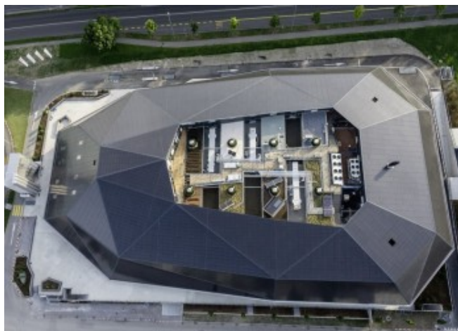
Top view of Umwelt Arena © René Schmid Architekten AG