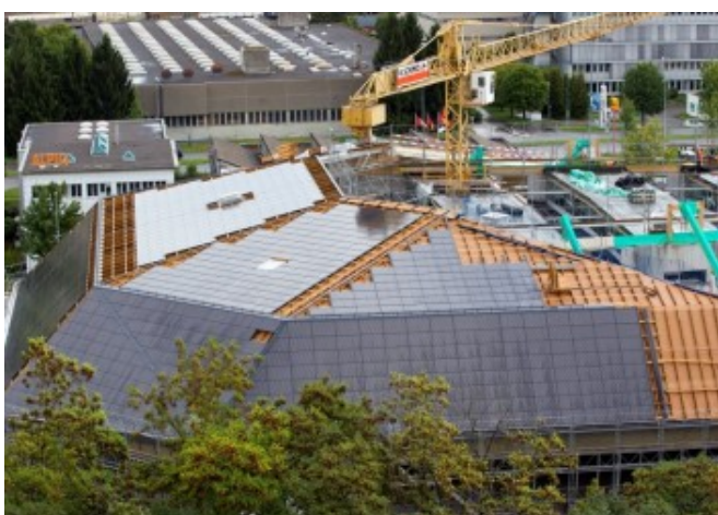
Umwelt Arena during construction © René Schmid Architekten AG