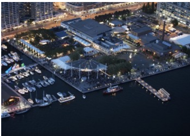
Harbourfront Centre, on the waterfront of Toronto, Ontario