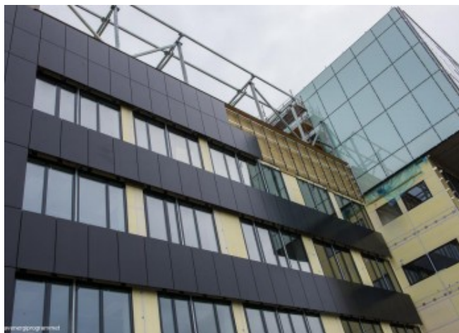
Mounting of the BIPV façade modules