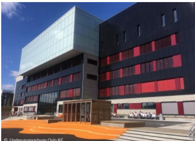
Red coloured elements were added by the architect to break up the black façade © Undervisningsbygg Oslo KF