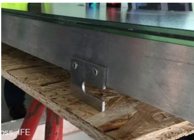
Details of BIPV module with mounting frame