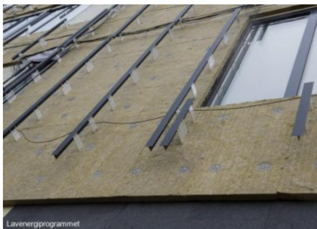
Black mounting brackets and modules give the façade a uniform appearance