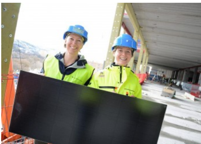
Environmental advisor and technical project manager