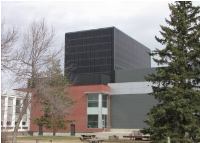
West and south façades