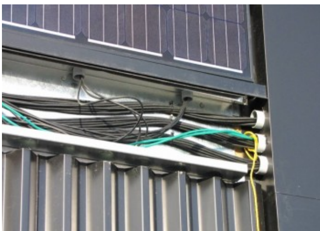
BIPV strings cables (DC) running into a gutter