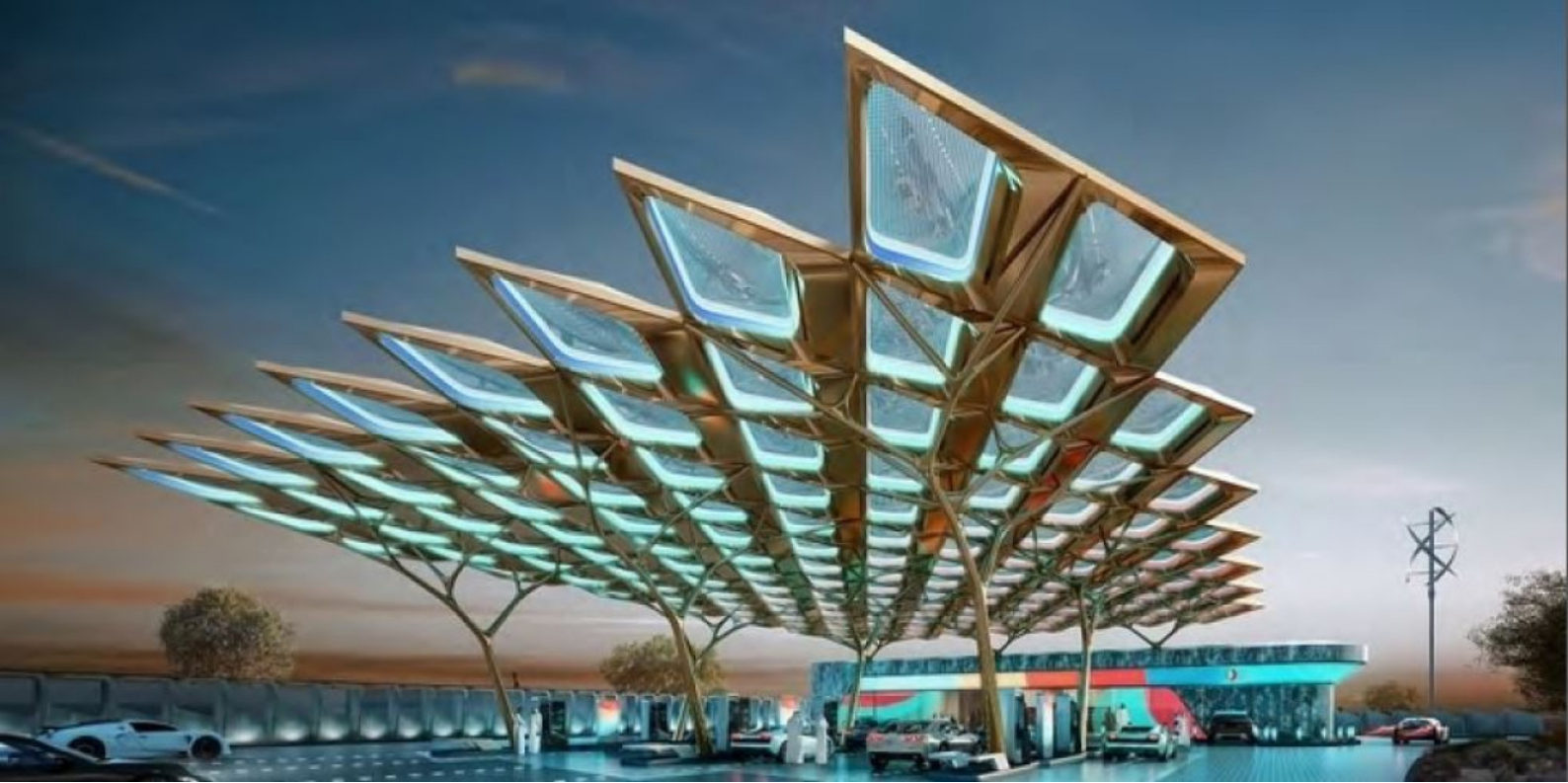
Stazione di servizio Expo 2020