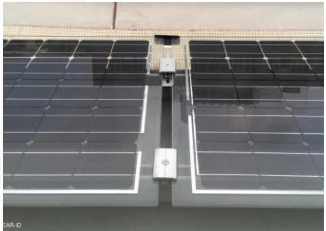
Detail of the fixation