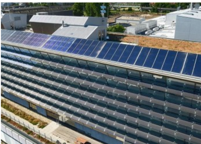
Zig-zag-BIPV façade with six stripes of PV and solar thermal collectors on the top