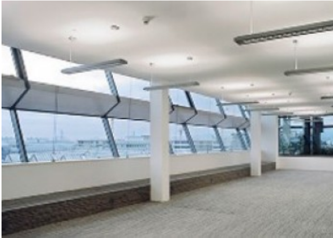
Open plan office