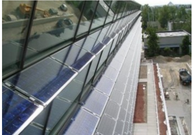
Folded BIPV façade © AIT-POS Architekten