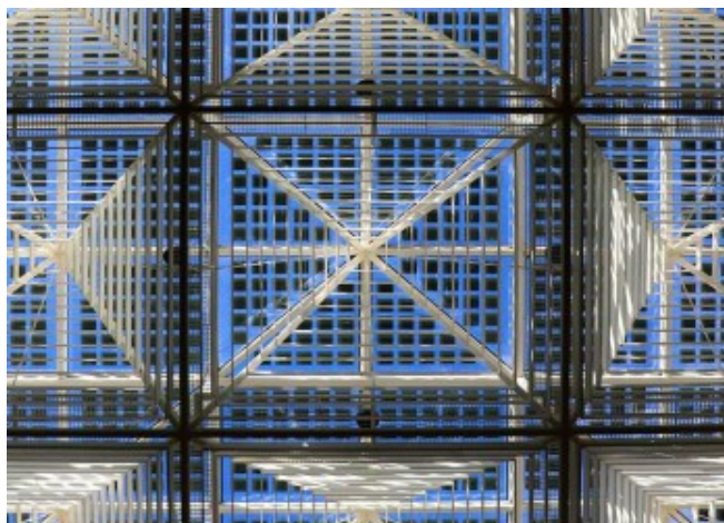
Close-up of the BIPV skylight from below