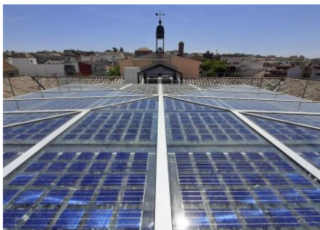
Close-up of the BIPV skylight from outside